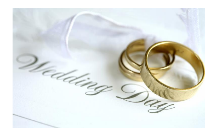
"As a bridegroom rejoices over his bride, so will your God rejoice over you" (Isaiah 62:5)

Congratulations on your engagement and forthcoming wedding!