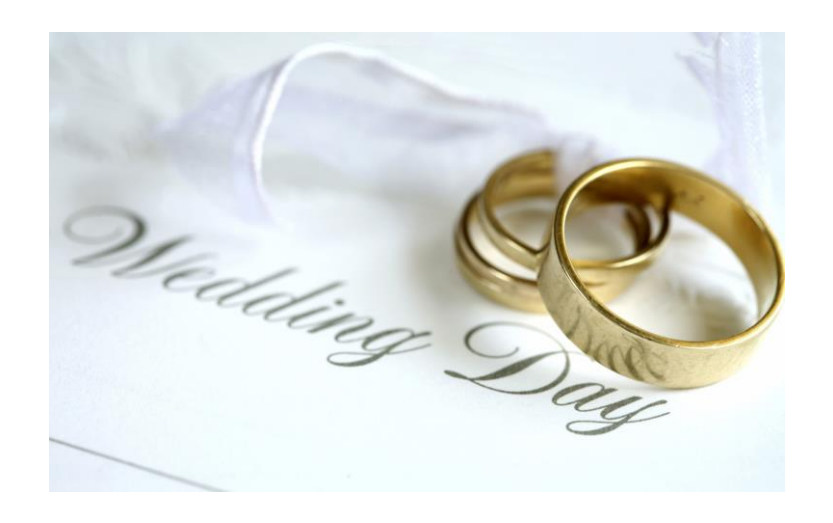
"As a bridegroom rejoices over his bride, so will your God rejoice over you" (Isaiah 62:5)

Congratulations on your engagement and forthcoming wedding!