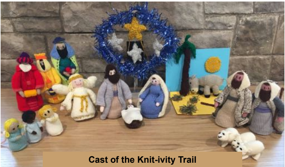
Cast of the Knit-ivity Trail