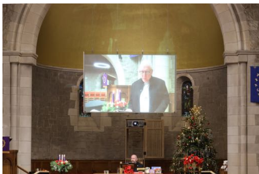
Our new technology in use

In his recorded message he congratulated the congregation on the 'stunning' refurbishment of the Sanctuary and conveyed the good wishes of the General Assembly to the congregation. His message was relayed to the limited number of members allowed to attend the service in Church on Sunday 13 December by means of the new technology installed during the refurbishment and to the whole congregation in the online service that Sunday.