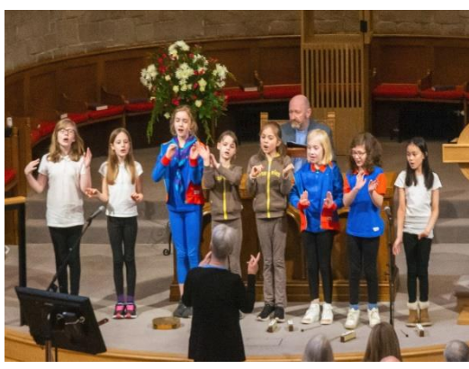
The Junior Singers