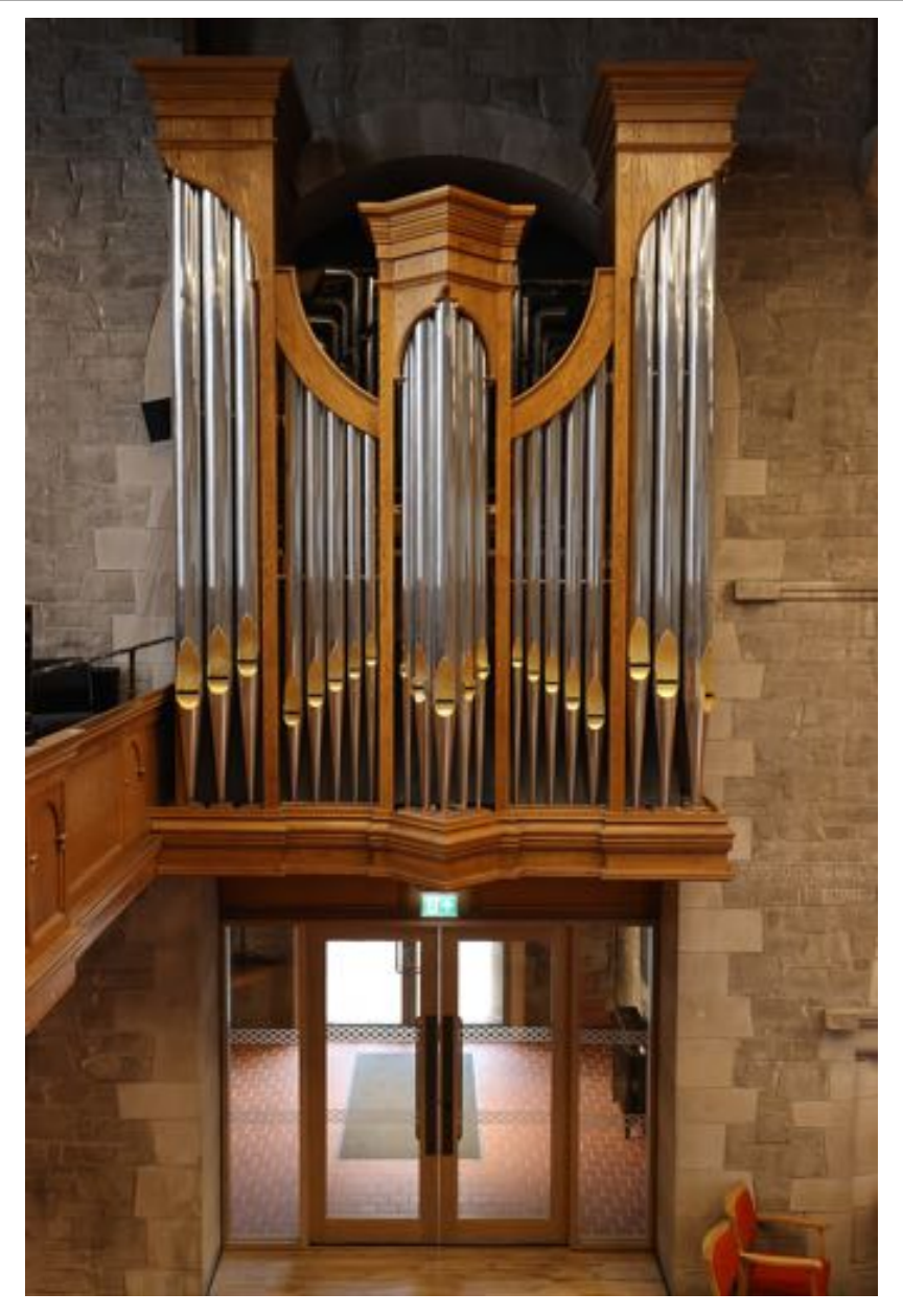
Inside, there are new doors from the vestibule into the Church , embellished with a Celtic design linked to lona Abbey where St Columba arrived in Scotland.