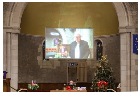
Our new technology in use

refurbishment of the Sanctuary and conveyed the good wishes of the General Assembly to the congregation. His message was relayed to the limited number of members allowed to attend the service in Church on Sunday 13 December by means of the new technology installed during the refurbishment and to the whole congregation in the online service that Sunday.